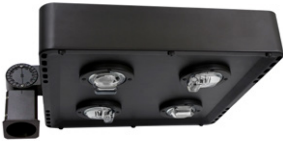
ASL (shown w/ adjustable slipfitter mounting adder)